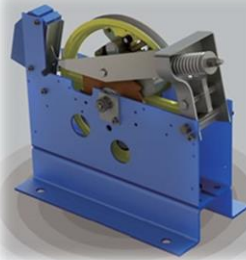
[ For MR ]