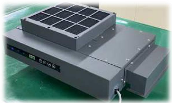
[ Elevator air purifier/sterilizer ]