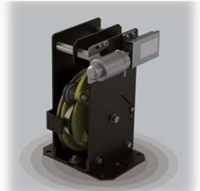
[For MRL ]